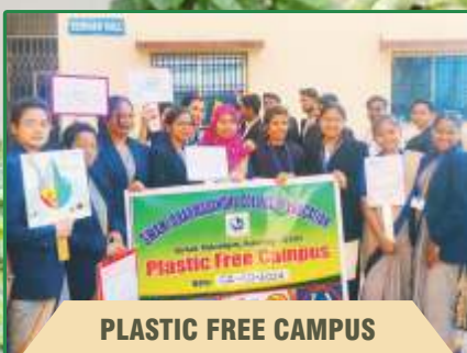
PLASTIC FREE CAMPUS