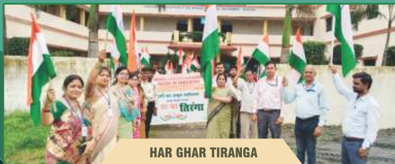
HAR GHAR TIRANGA