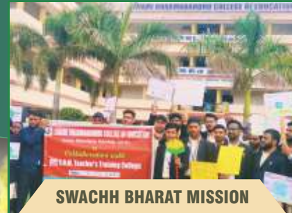
SWACHH BHARAT MISSION