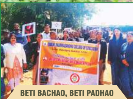
BETI BACHAO, BETI PADHAO