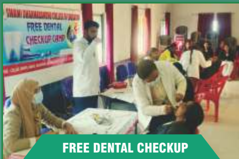
FREE DENTAL CHECKUP