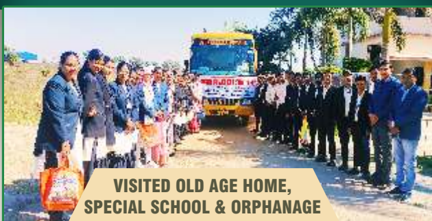
VISITED OLD AGE HOME, SPECIAL SCHOOL & ORPHANAGE